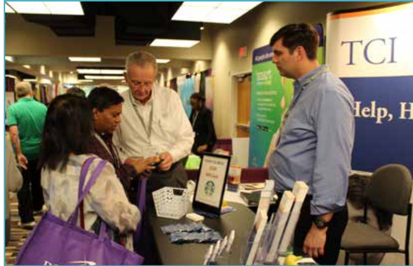
Exhibit Hall Schedule:

All matters and questions not covered by these regulations are at the discretion of ASAM. These regulations may be amended at any time by ASAM and all amendments shall be equally binding on all parties upon publication.